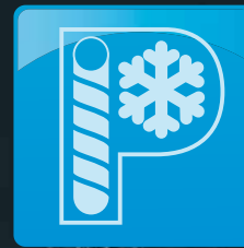
Heat Mat PipeGuard