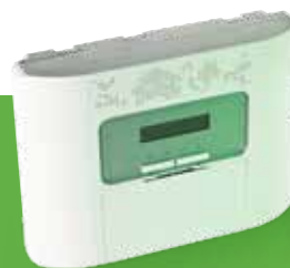
PowerMaster-30 G2 64-zone control panel