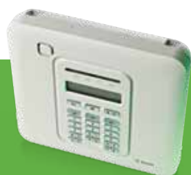
PowerMaster-10 G2 30-zone control panel