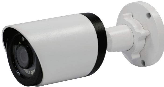
SHDVC36FB(W/G) 4 MEGAPIXEL BULLET CCTV CAMERA