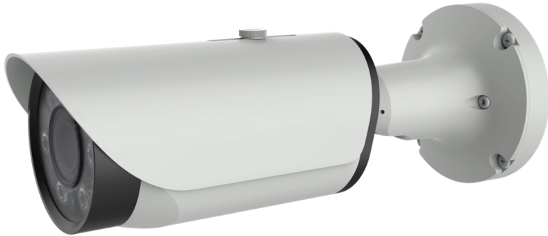
SHDVC550VFB(W/G) 4 MEGAPIXEL BULLET CCTV CAMERA