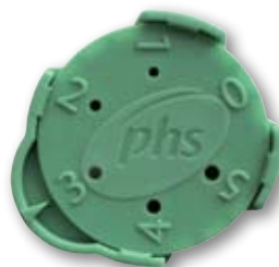
Flush-wiser® WC Flush Control

Other water saving products now available from Warner Howard: