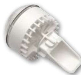
Eco-shield™ Urinal Sleeve