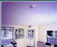
The Break Glass 2000 can be either wall or ceiling mounted. Above is an example of ceiling mount option.