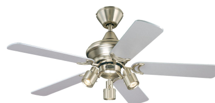
Reversible Silver Finish Blades