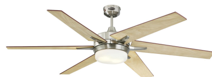
Reversible Light Maple Finish Blades